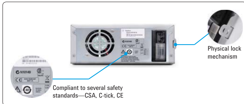
Figure 3. Safety and security features of the U8000 Series single output DC power supplies