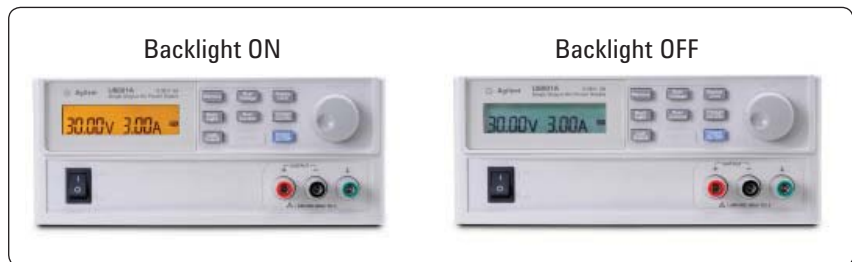
Figure 2. Backlight on/off options for LCD display